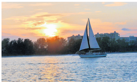
Spectacular Sunset Sail.