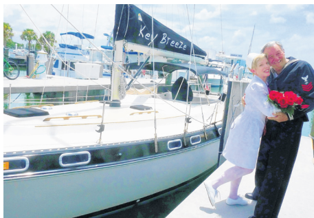
Guests include the “Kissing Sailor”.