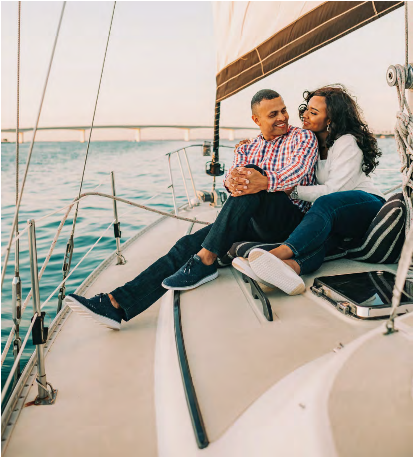
A sunset sailing trip along Sarasota Bay.